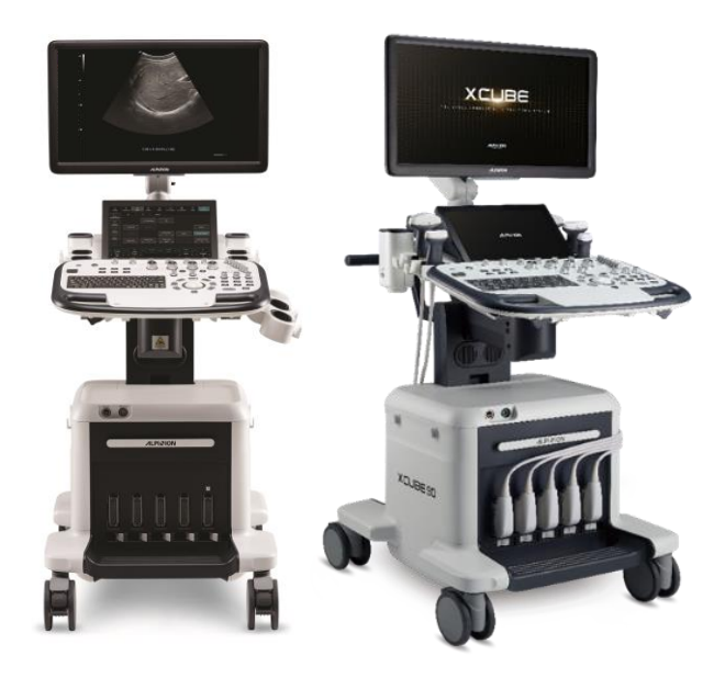
Figure 1. ALPINION MEDICAL SYSTEMS X-CUBE 90/70 Ultrasound Machine

This study included 37 patients who had undergone liver stiffness using FibroScan using Transient Elastography (FibroScan, Echosens). 7 patients with reliability measurement index (RMI) of less than 0.5 and interquartile range/median ratio (IQR / M) of more than 30% were excluded. So, total patients were 30 (Table 1). Measurement of the liver stiffness from pSWE using the X-CUBE 90 (Alpinion Medical Systems) was performed (Figure 1). The performance of pSWE was compared to that of FibroScan as a reference standard. Receiver operating characteristic curve analyses were performed to calculate the area under the receiver operating characteristic curve (AUC) for F \ge 2 , F \ge 3 and F = 4.